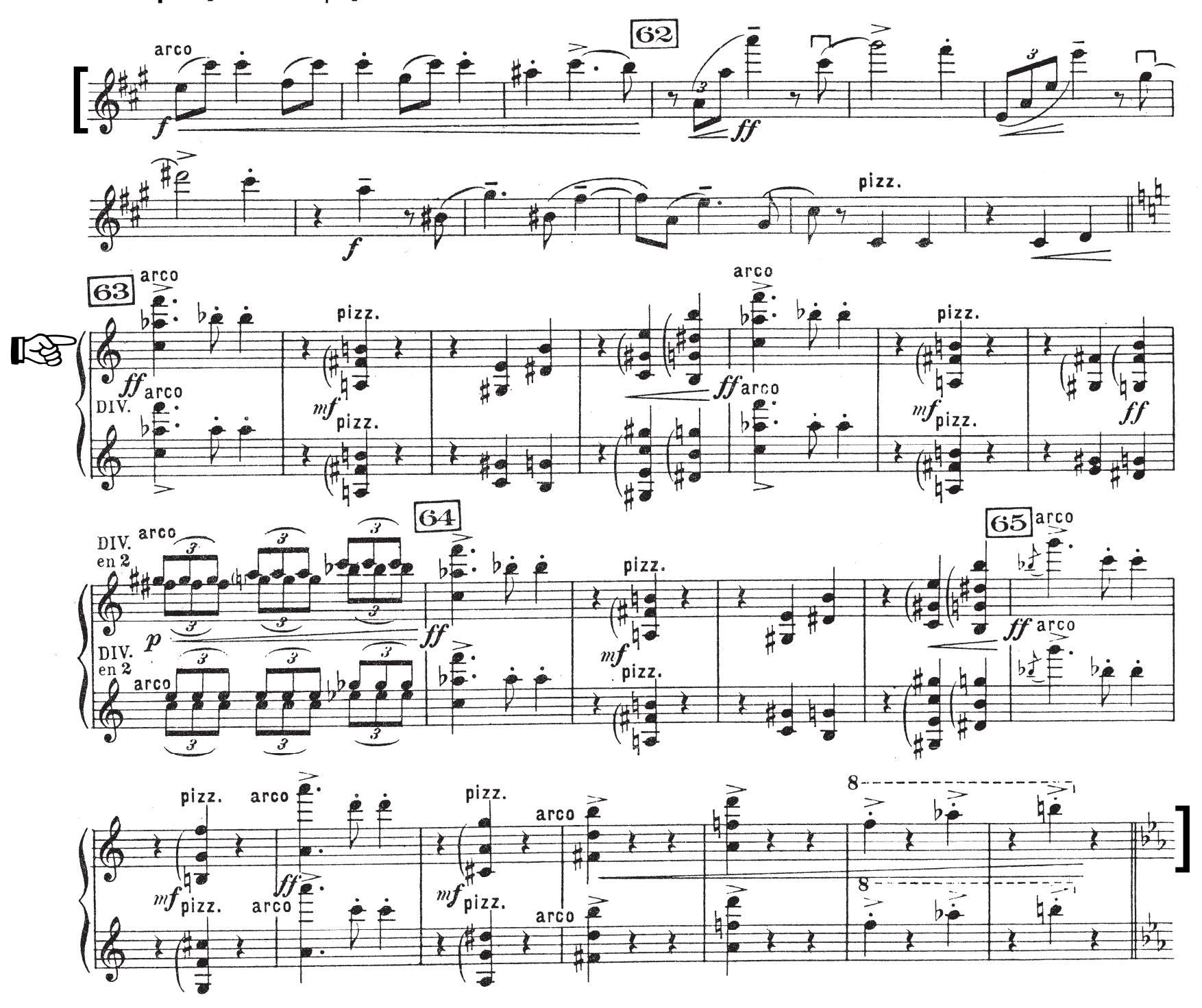
Excerpt 2 [same tempo]