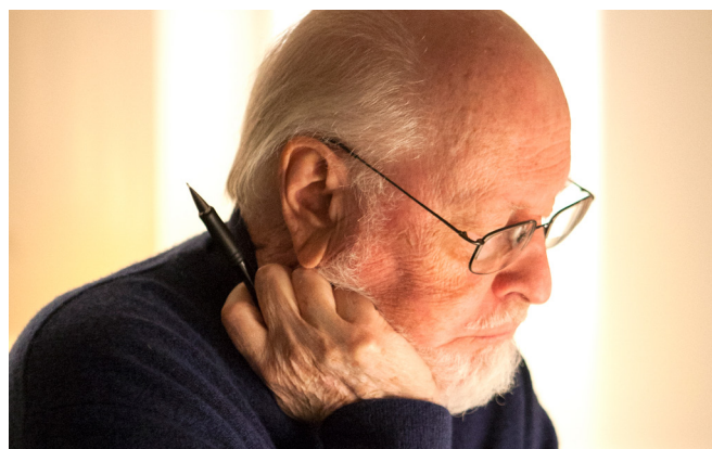
John Williams.

In 2021, Williams premiered his second violin concerto with the Boston Symphony Orchestra at Tanglewood along with soloist Anne-Sophie Mutter, for whom he composed the work.