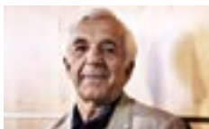
Vladimir Ashkenazy Conductor Laureate