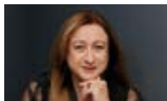
Simone Young AM Chief Conductor