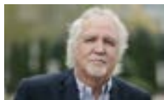
Donald Runnicles Principal Guest Conductor