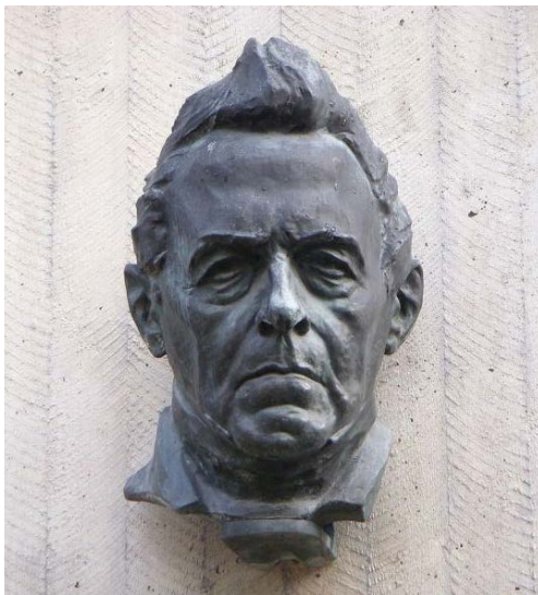
A bronze bust of Franz Berwald by Swedish sculptor Carl Eldh (1873-1954), on display in Gothenburg Concert Hall.