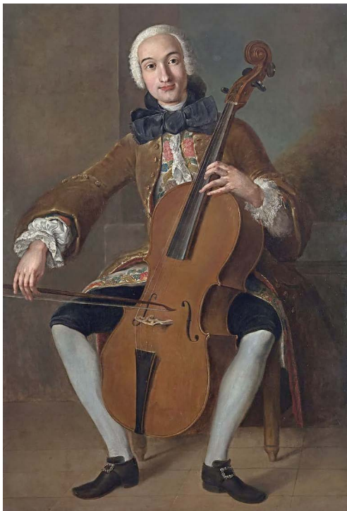
Luigi Boccherini playing the violoncello (c.1764–1767) by Pompeo Batoni (1708–1787). Source: National Gallery of Victoria.

Thus, like Haydn, Boccherini found himself slightly isolated, but at liberty to compose more or less as he wished for over a decade. He stayed in Spain, dying in Madrid in 1805, despite receiving the patronage of the likes of Friedrich Wilhelm II of Prussia.