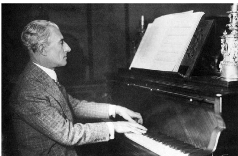
Ravel at the piano

French master. In Gaspard de la nuit he famously set out to write his version of Lisztian piano music, wryly suggesting that he 'might have overdone it'. His Shéhérazade songs evoke a typical early-20th century view of Asia where orchestration and subject matter relate directly to Russian music, especially that of Rimsky-Korsakov. His most famous piano piece, the Pavane for a dead Infanta , resurrects a gracious renaissance dance, tinged with his beloved Spanish idiom.