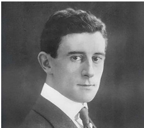
Photo of Maurice Ravel published in The Musical Times on 1 December 1913.

Ravel's works are frequently, exquisite simulacra of existing styles and forms. In his Tombeau de Couperin , twentieth century piano music pays a genuine homage to the baroque suite and keyboard style of the earlier