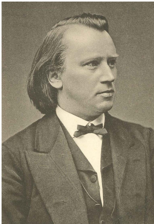
Johannes Brahms c. 1875.

His earliest works are for piano, some for public performance (though with an eye firmly on his posterity, Brahms destroyed a great many pieces in all genres) and some as studies.