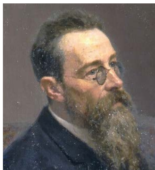
Portrait of Composer Nikolai Andreyevich Rimsky-Korsakov (1893) by Ilya Repin (1844–1930).

Contemporary music included Hugo Wolf's Italian Serenade , Verdi's Otello and Bruckner's Eighth Symphony.