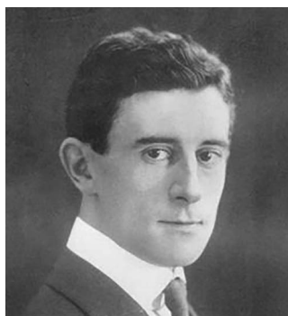
Photo of Maurice Ravel published in The Musical Times on 1 December 1913.

Contemporary music included Schoenberg's Pierrot lunaire , Richard Strauss' Ariadne auf Naxos and Alban Berg's 'Altenberg' Lieder.