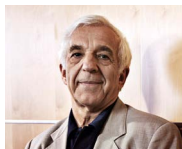
Vladimir Ashkenazy Conductor Laureate