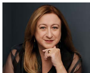
Simone Young AM Chief Conductor