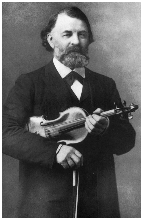
Violinist Joseph Joachim in 1890.

Brahms spent the summers of 1877-9 in the lakeside village of Pörschach in Carinthia, producing his first Motet, Op.74, the Ballades for piano, Op.75, Symphony No.2 and his Violin Sonata in G, Op.78 – all works which share an atmosphere of pastoral beauty shot through with nostalgia. But as Brahms scholar Karl Geiringer notes, the ‘crowning masterpiece’ of this time is the Violin Concerto.