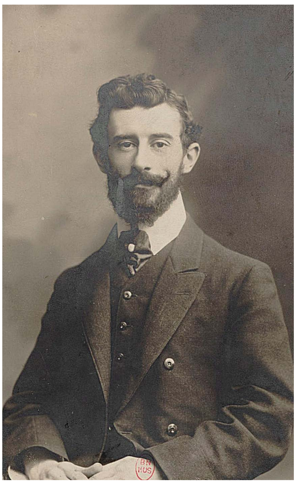
1907 photograph of Maurice Ravel.