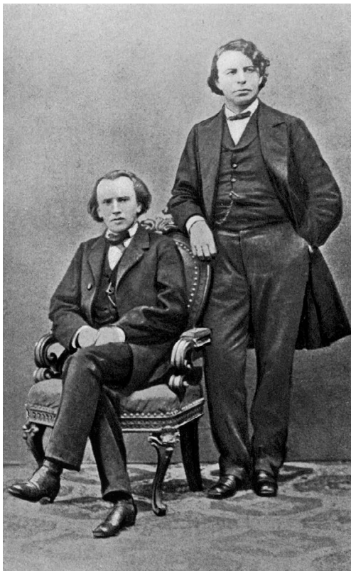
Brahms and Joseph Joachim in 1855

Our most recent performance was in 2022, with Augustin Hadelich conducted by Sir Donald Runnicles.