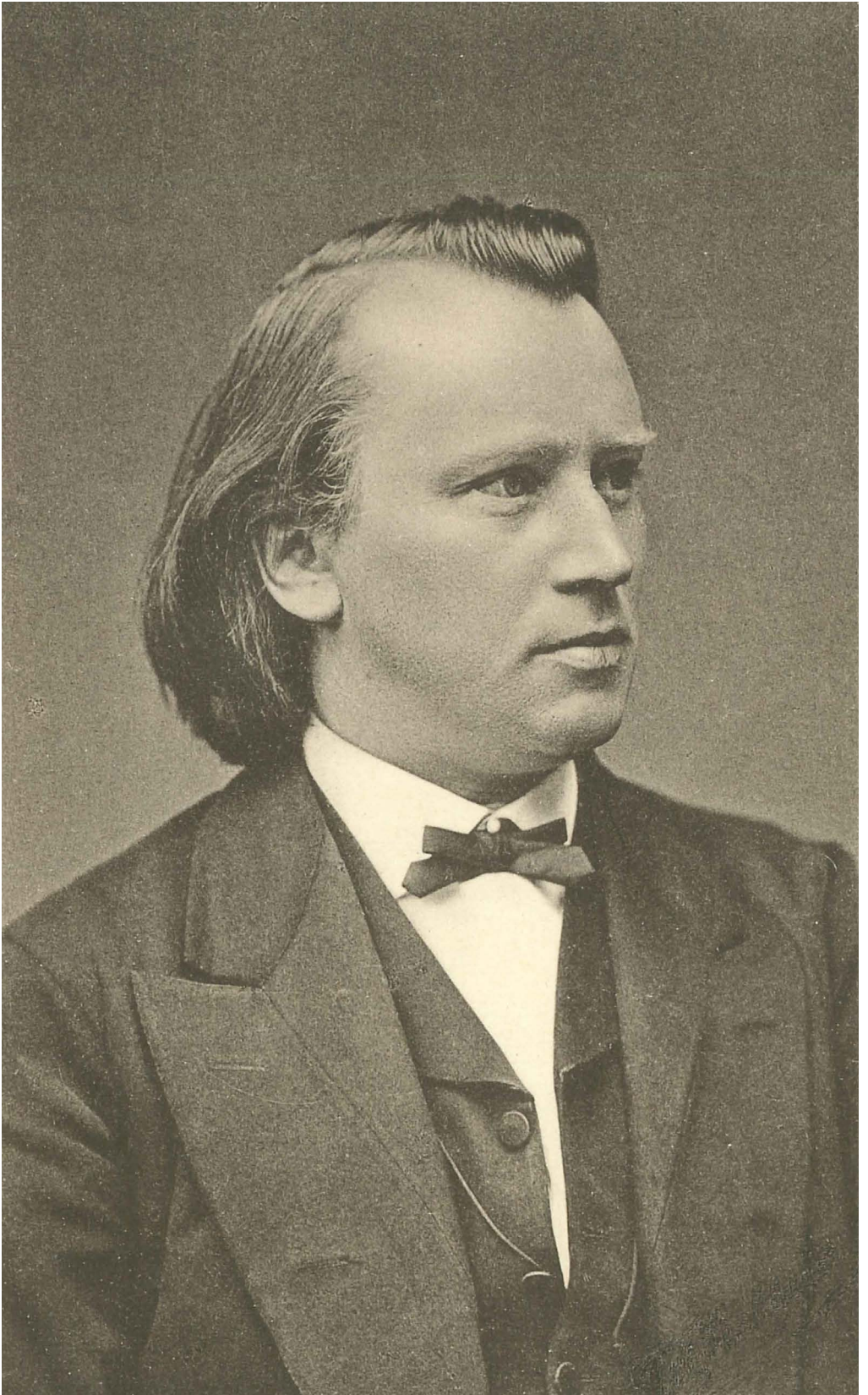
Johannes Brahms c. 1875 by German photographer Fritz Luckhardt (1833–1894).