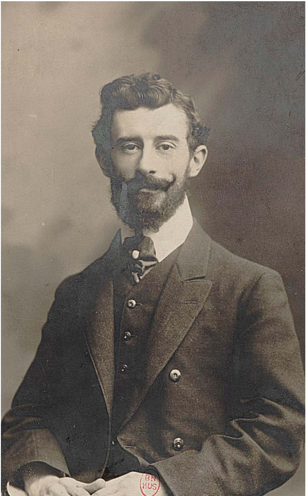
1907 photograph of Maurice Ravel by Pierre Petit.