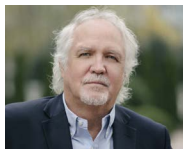
Donald Runnicles Principal Guest Conductor