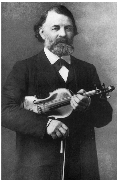
Violinist Joseph Joachim in 1890.

Brahms spent the summers of 1877-9 in the lakeside village of Pörschach in Carinthia, producing his first Motet, Op.74, the Ballades for piano, Op.75, Symphony No.2 and his Violin Sonata in G, Op.78 – all works which share an atmosphere of pastoral beauty shot through with nostalgia. But as Brahms scholar Karl Geiringer notes, the ‘crowning masterpiece’ of this time is the Violin Concerto.