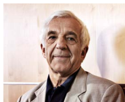
Vladimir Ashkenazy Conductor Laureate