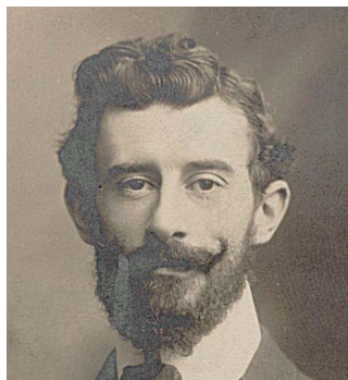
1907 photograph of Maurice Ravel by Pierre Petit.